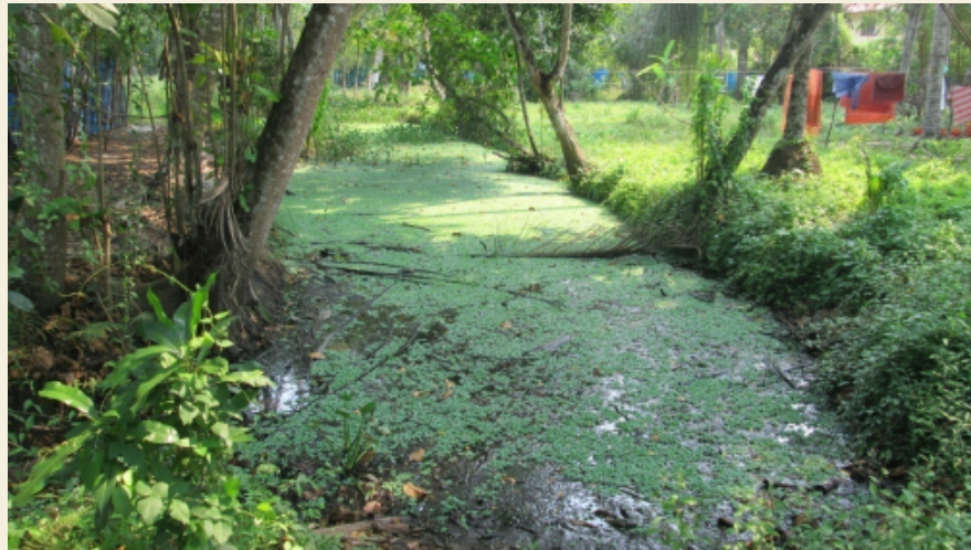
Excess weed accumulation