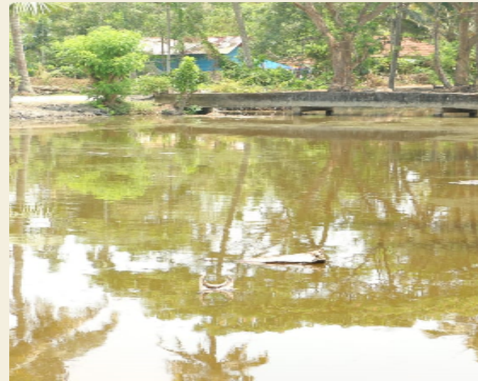
Cherthala South Grama Panchayat