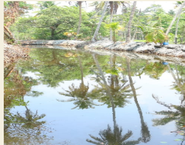
Kadakkarappally Grama Panchayath