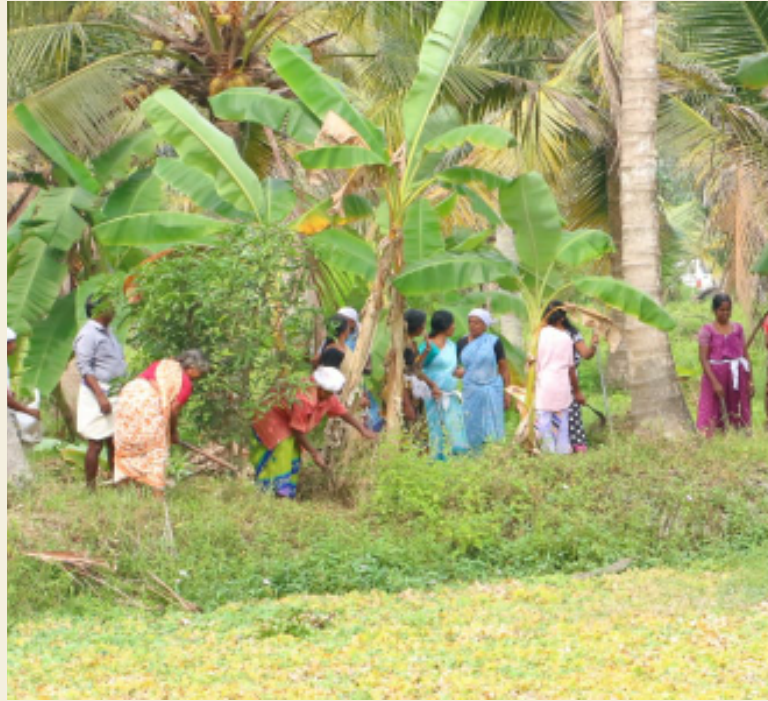
Side clearance under MNREGS

(Weed clearance, Compost with weeds, Strengthening of sidewall with excavated earth, Side clearance, Mulching with Silt )